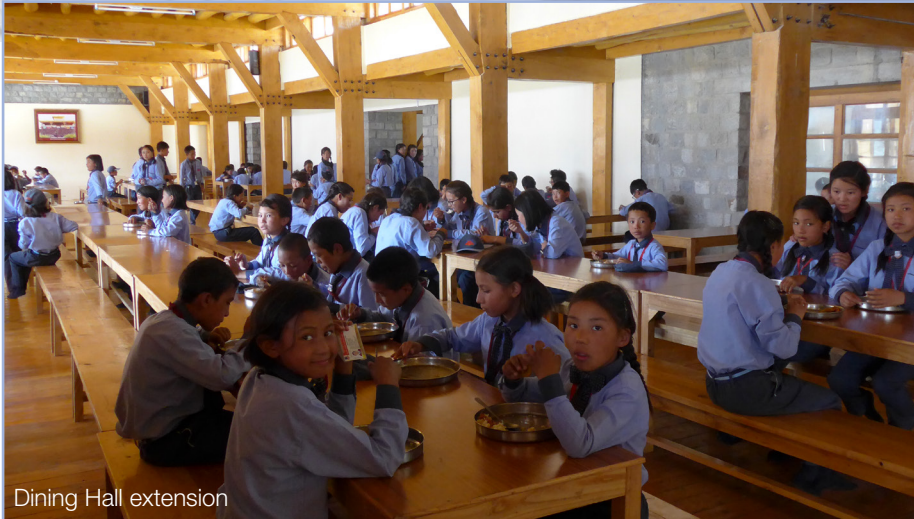
Dining Hall extension